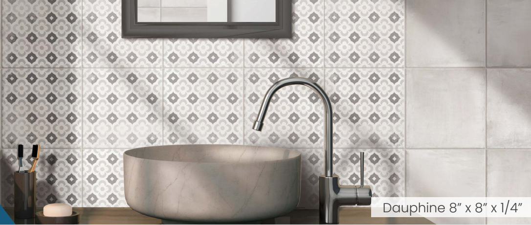
Dauphine 8" x 8" x 1/4"