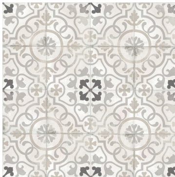
Lafayette 8" x 8" x 1/4" IFS8X8L