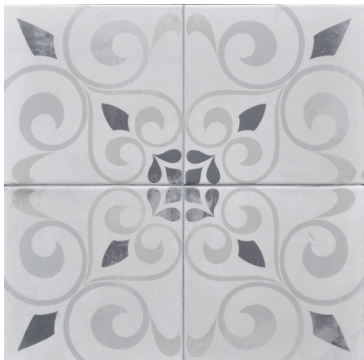
Orleans 8" x 8" x 1/4" IFS8X8O