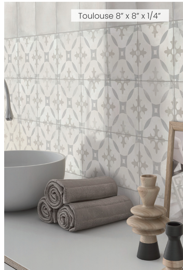
Toulouse 8" x 8" x 1/4"

View all of our product options and detailed specifications at: mlwsurfaces.com