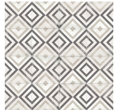
Magazine 8" x 8" x 1/4" IFS8X8M