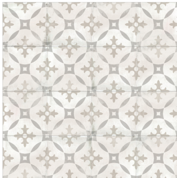
Toulouse 8" x 8" x 1/4" IFS8X8T